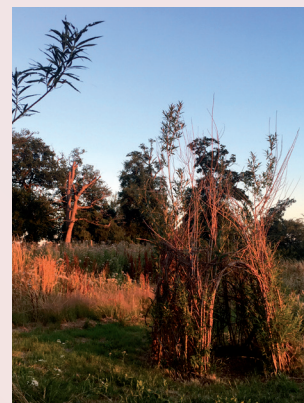
Le jardin de la Borie