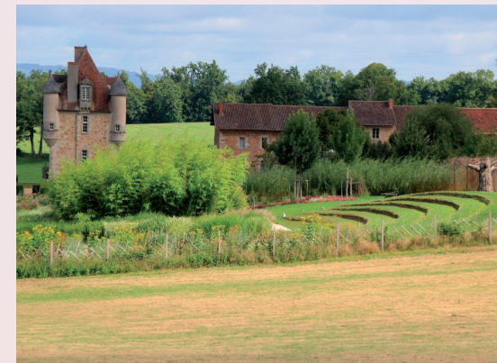
Le jardin avec le Théâtre de Verdure