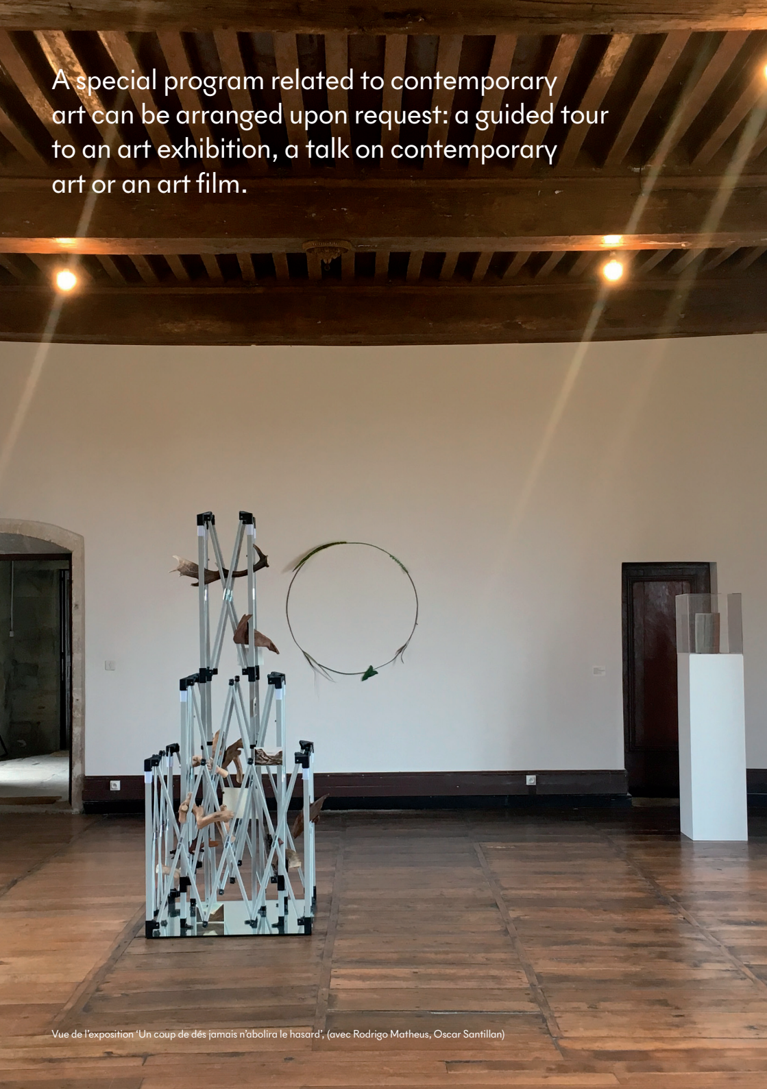
Vue de l'exposition 'Un coup de dés jamais n'abolira le hasard', (avec Rodrigo Matheus, Oscar Santillan)

A special program related to contemporary art can be arranged upon request: a guided tour to an art exhibition, a talk on contemporary art or an art film.