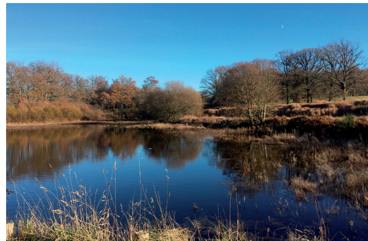
L'étang et les bois du domaine