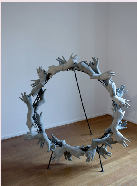
István Csécskányi, Concrete Wreath

Mme Ardi Poels Château de la Borie 87110 Solignac France M info@artlaborie.com T + 33 (0) 7 85 41 99 55